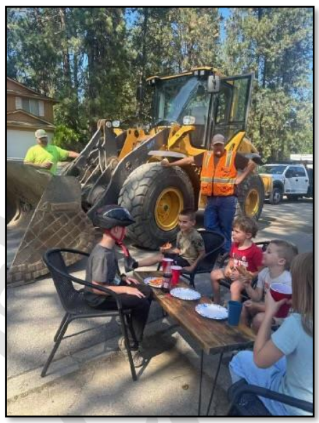
Big Sky Inc. Throwing a Pizza Party and Equipment Tour for Local Kids During the Buttercup & Wardson Project.

Radio Tower Upgrades: The District utilizes radio communications between the tanks, wells, and booster stations to keep water tanks full and the system in pressure. In 2023, we upgraded infrastructure which included replacing radios and installing new towers to improve signal.